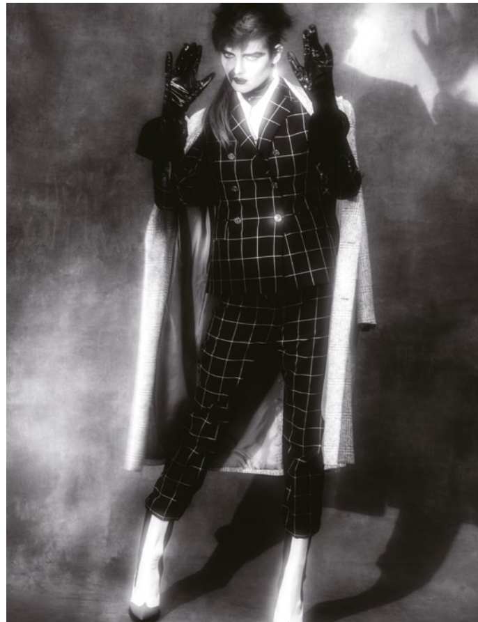
left coat. Necessity Sense suit + shoes. Thom Browne top. Tory Burch bib. Tableaux Vivants gloves. Scarlet Sage