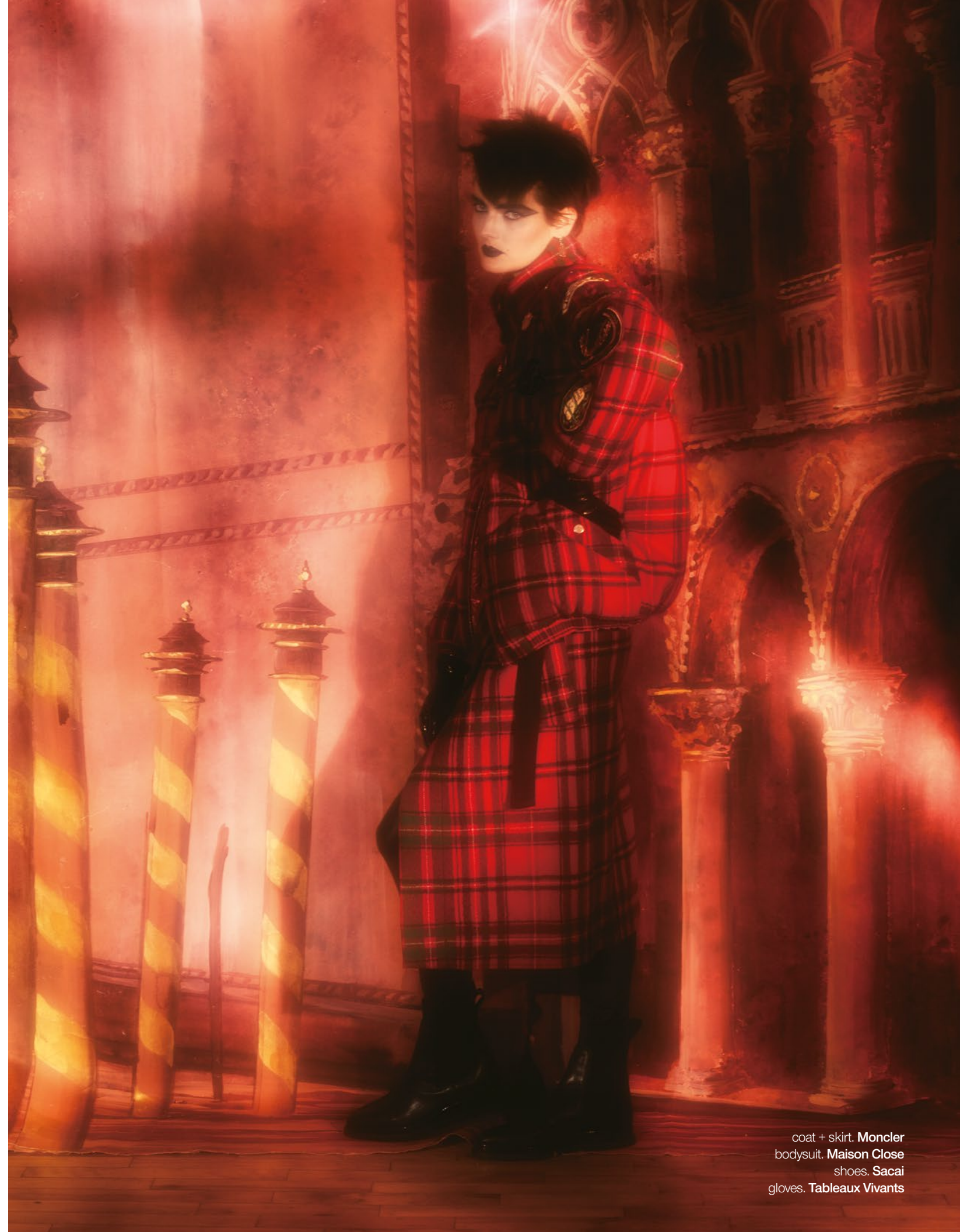
coat + skirt. Moncler bodysuit. Maison Close shoes. Sacai gloves. Tableaux Vivants