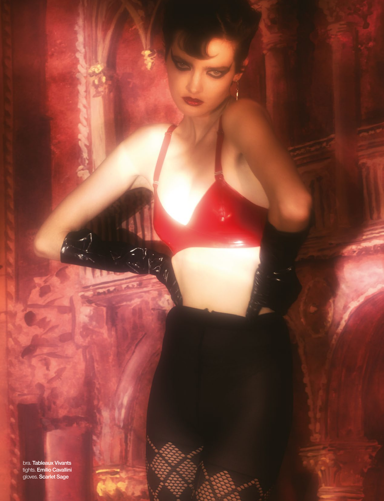
bra. Tableaux Vivants tights. Emilio Cavallini gloves. Scarlet Sage