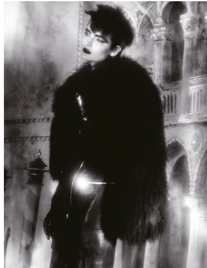
right coat. Cushnie jacket. Belstaff gloves. Tableaux Vivants